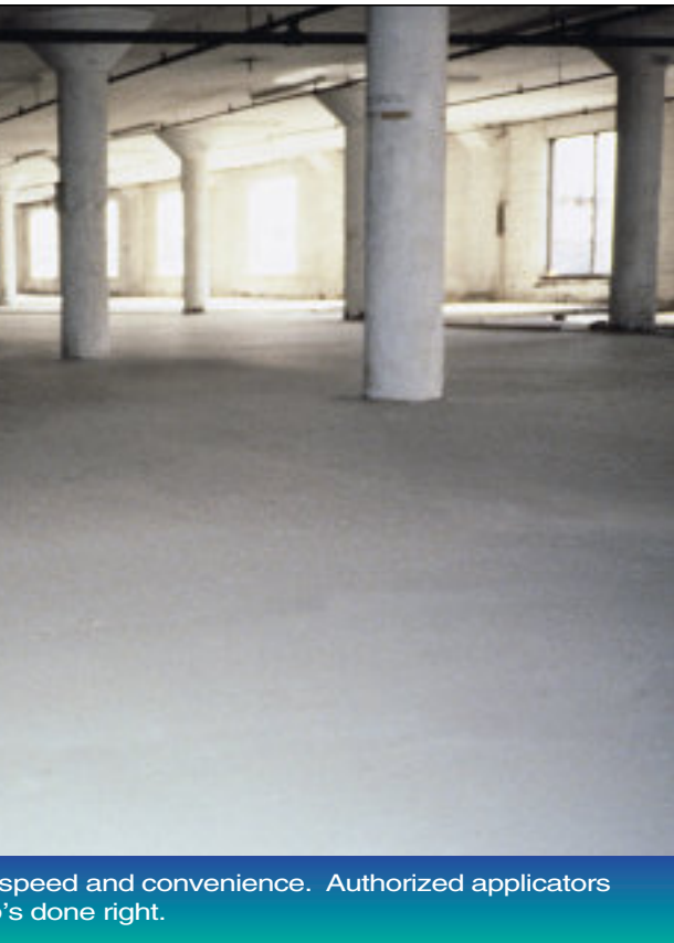
speed and convenience. Authorized applicators 's done right.

free. Cracks should be filled with a crack filler or an elastomeric compound. Plumbing or electrical penetrations should be packed with insulation and sealed.